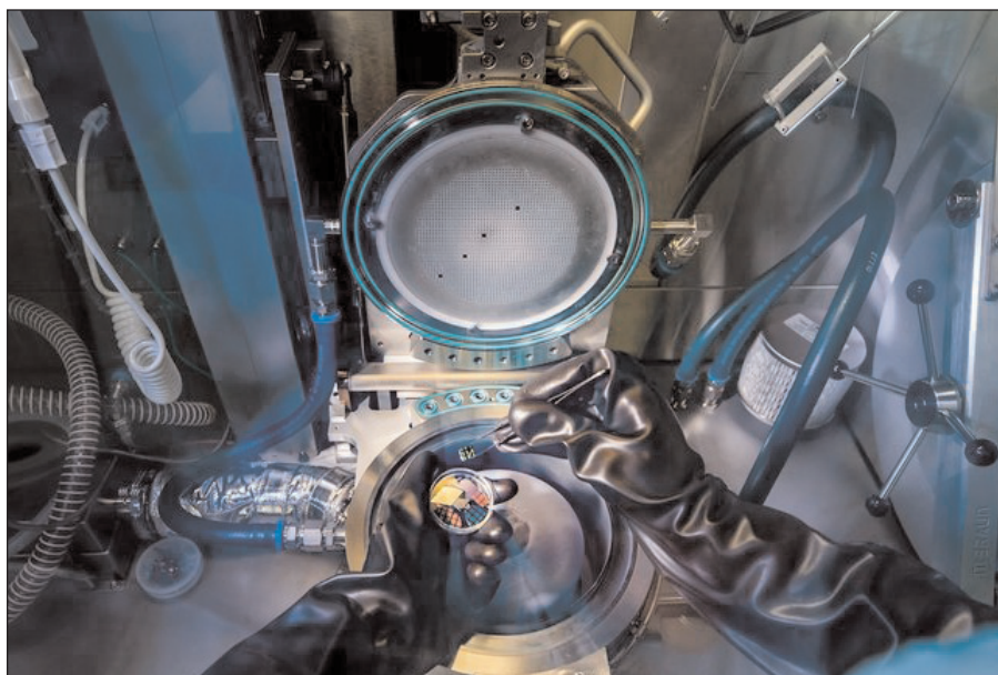
Inside the metal-organic vapor phase epitaxy reactor used to grow the nanowires with hexagonal SiGe shells.

Initially, however, these structures could not be stimulated to emit light. Through exchanging ideas with colleagues at the